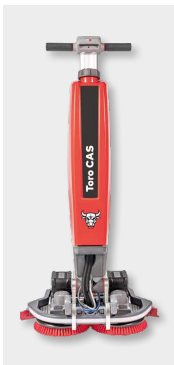
Cleanfix Toro CAS in working position