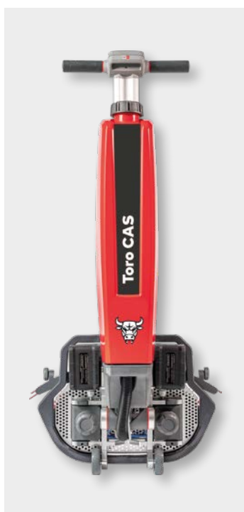
Cleanfix Toro CAS in transport position