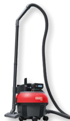
S10 Plus CAS